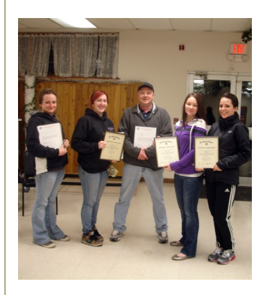
Staff members were presented with certificates of appreciation for their volunteer work. Not pictured is Heather Harkness.